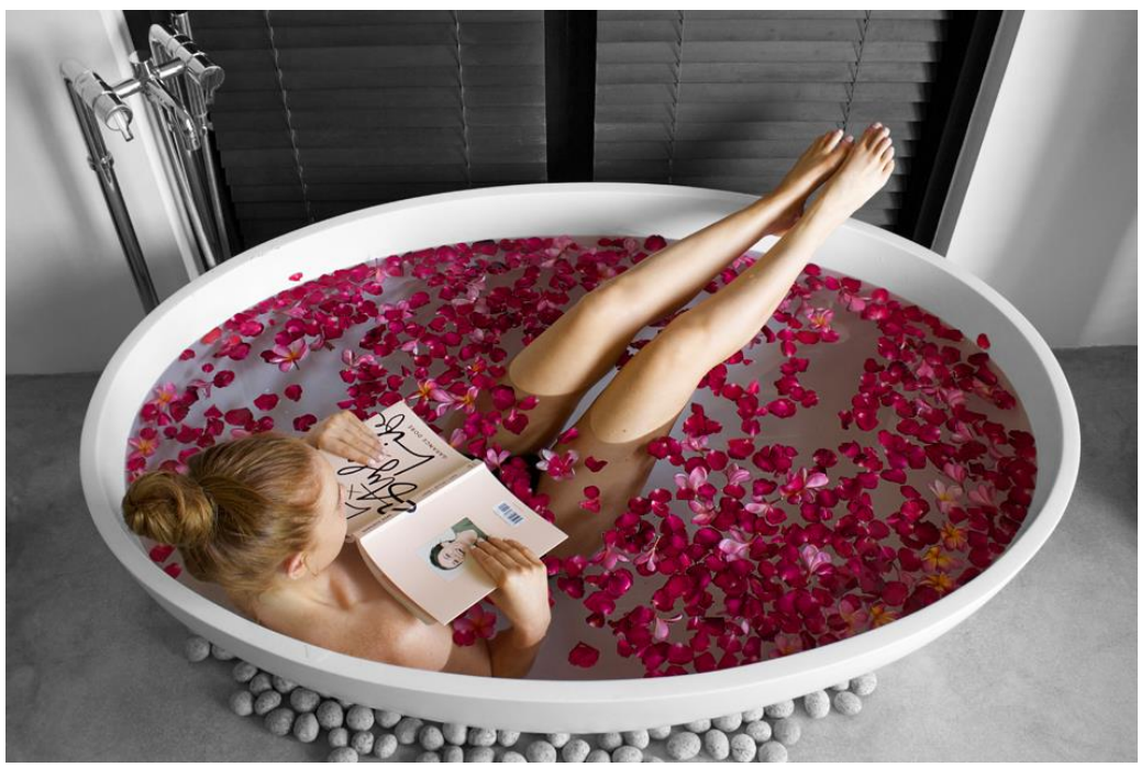
Another pinch me moment at Villa Hana with <u>The Asia</u> <u>Collective</u>.